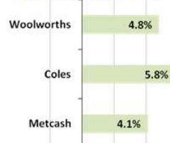
Retailer same store sales year to 31 March 2010

Metcash is confident of more growth in their earnings per share in the 2011 financial year based on stable economic conditions but expects a slowing in sales growth in the food and liquor sectors due to the fading of government stimulus, weak food inflation and the effect of interest rate rises. For the year completed, it reported comparative same store sales up 4.1% but did not reveal the quarterly dissection in this indicator. Over the full year our analysis indicates the Metcash distribution activities grew its underlying sales slower than that of Coles and Woolworths.