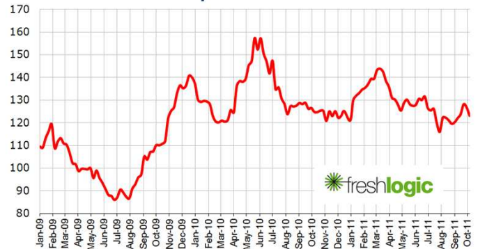
Australasian export index from Jan 2009

Take note: The index is an indicator of spot trends in gross export returns to the industry based on quoted Australasian export prices, movements in currency and the total milk usage in exports by the Australian industry. It was set at 100 on 1 January 2004.