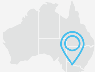
Mincha West Victoria